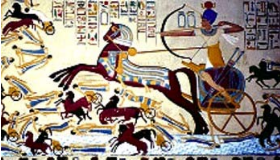
Pharaoh Amose, founder of the 18 th Dynasty, shown dispatching Hysos